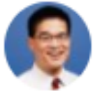
Edwin Park @EdwinCPark